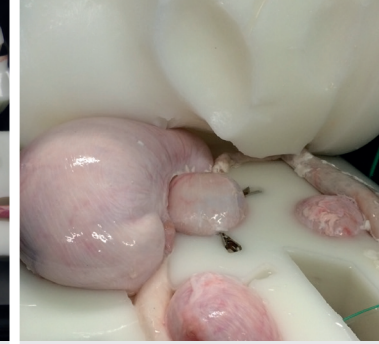
Organs integrated into the matrix