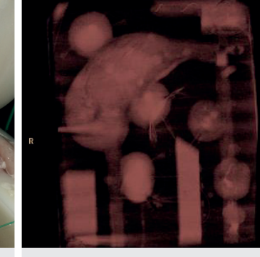
CT topogram of organs and biopsy objects